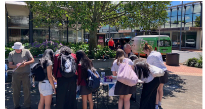
Waikato in action at the table